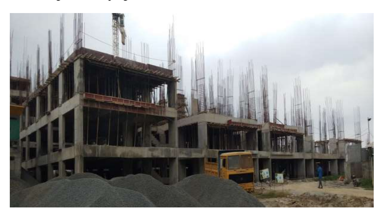
Block D1: Pile Cap Works Complete. Earthwork backfilling & PCC for on Progress. First Floor 1st Half Slab Shuttering works are on progress.

Block C3: Second Floor 1<sup>st</sup> Half concrete completed & in 2<sup>nd</sup> half portion shuttering works are on progress. In Third Floor 1<sup>st</sup> Half Slab Shuttering & Barbending works on progress