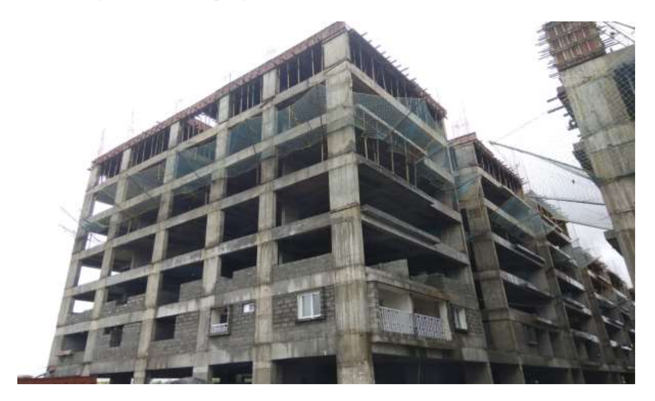
Block C2: Fourth Floor slab 1<sup>st</sup> Half concrete completed & in 2<sup>nd</sup> half portion slab shuttering & barbending works are on progress.