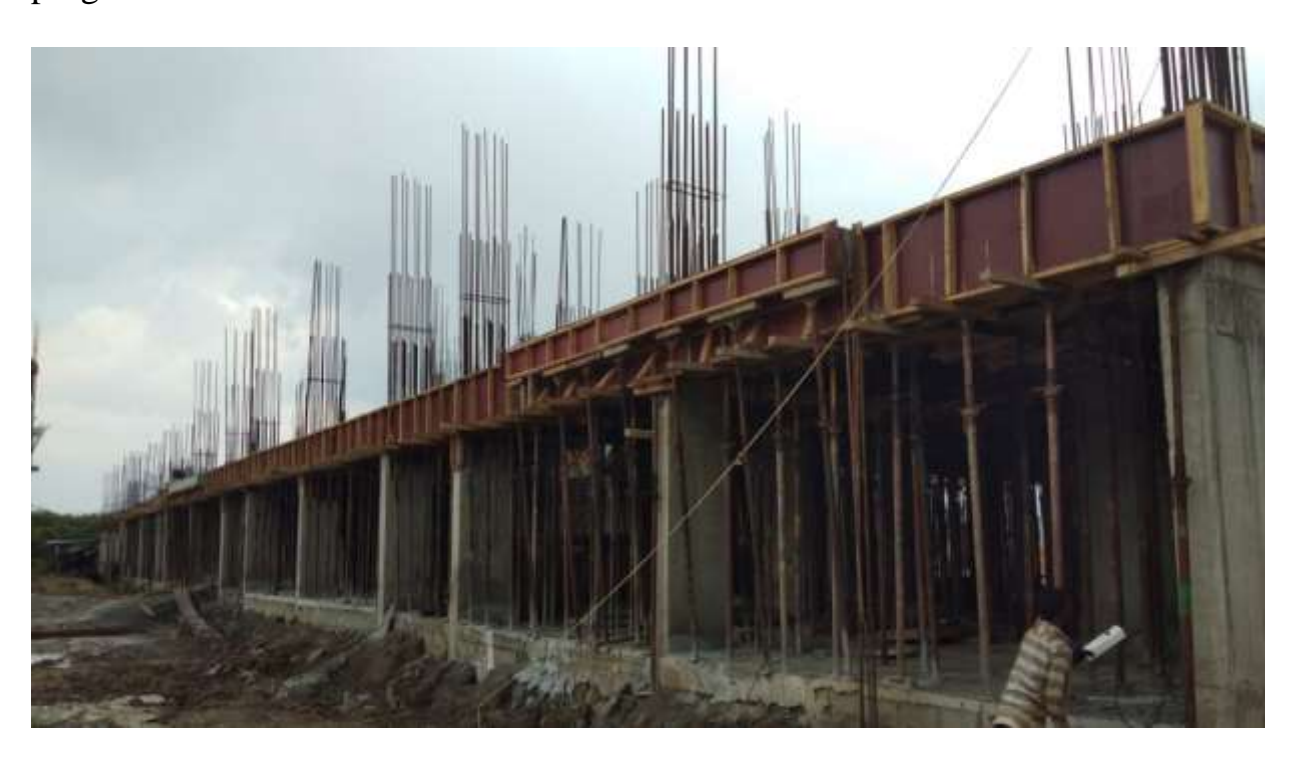
Block A2: First Floor Slab shuttering & barbending works are on progress.

Block A1: First Floor slab 1st Half concrete completed & Second half on progress.