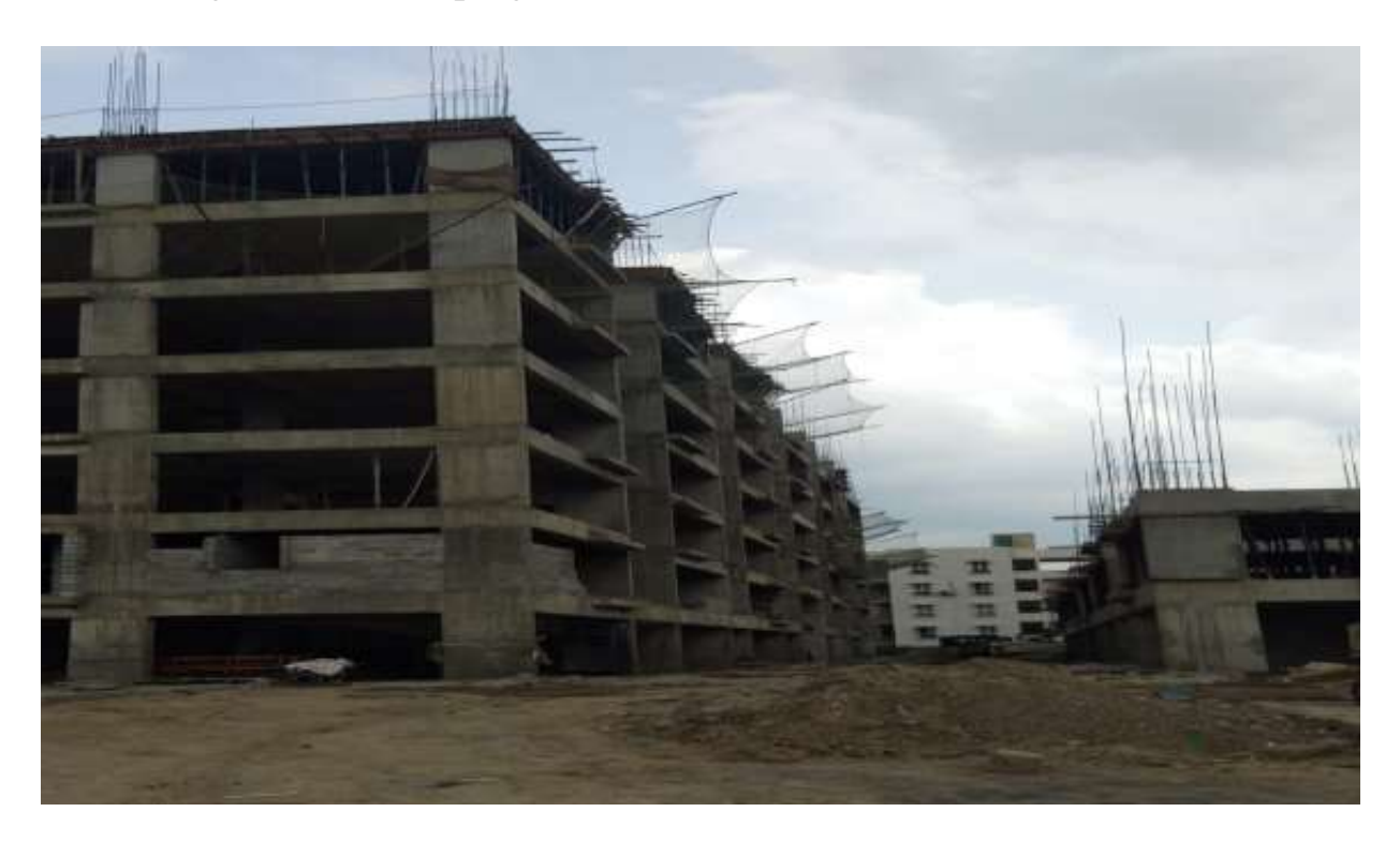
Block B2: Second Floor slab 1<sup>st</sup> Half concrete completed & in 2<sup>nd</sup> half portion slab shuttering & barbending works are on progress.