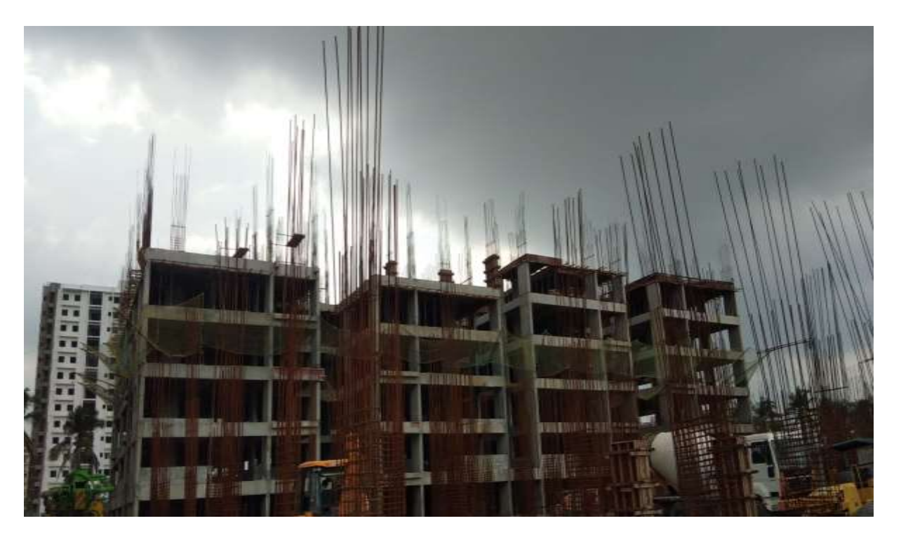
Block D3: Fourth Floor slab 1<sup>st</sup> Half Portion Shuttering & Barbending works are on progress.

Block D2 : Sixth Floor slab 1^{\rm st} Half Portion Shuttering & Barbending works are on progress.